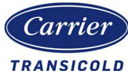
Figure 3.3 Generator Set Manufacturer's PREMIUM Warranty, 5 Year