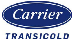
Figure 3.4 Generator Set Manufacturer's PREMIUM Warranty, 7 Year

Carrier Transicold Pte. Ltd. Carrier Transicold Division Carrier Corporation