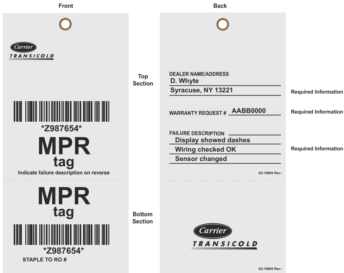
Figure 6.1 MPR Return Material Tag